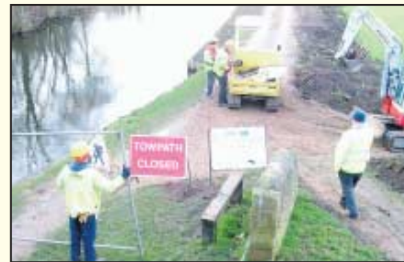
Economic Development Zone work on Lancaster Canal

The first phase includes a link from Caton Road/Langdale